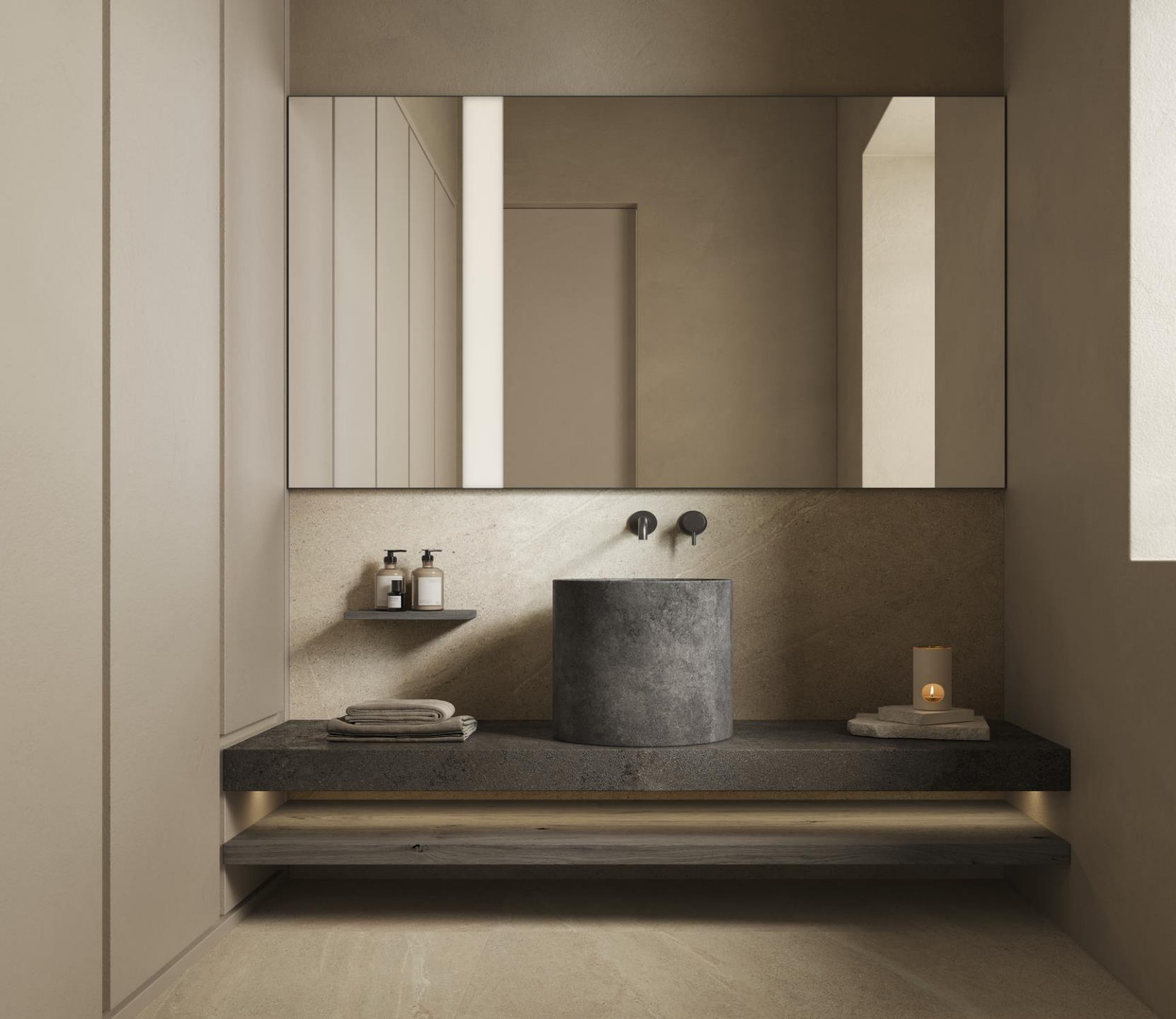
Guest bathroom in the living area