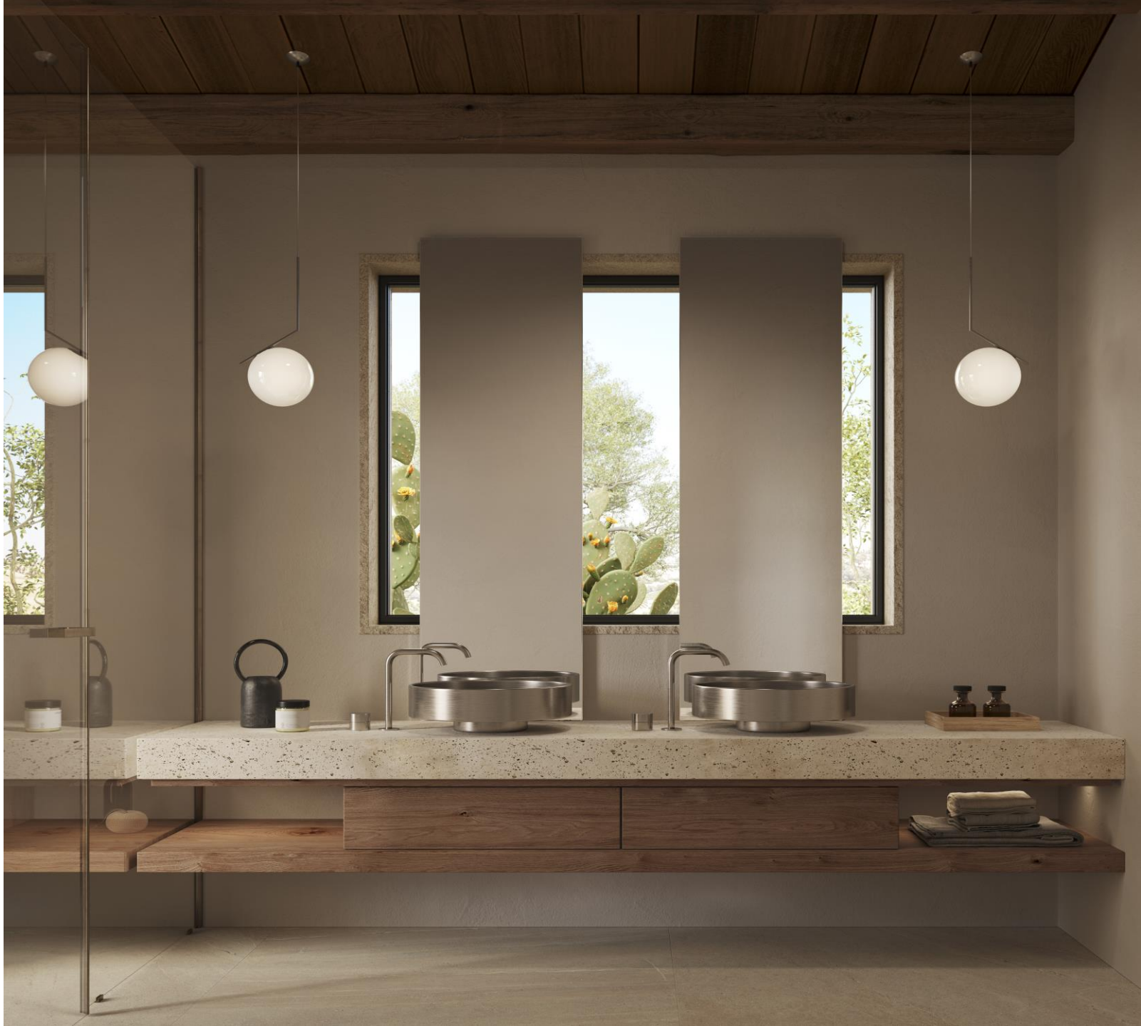
Bathroom of the master bedroom